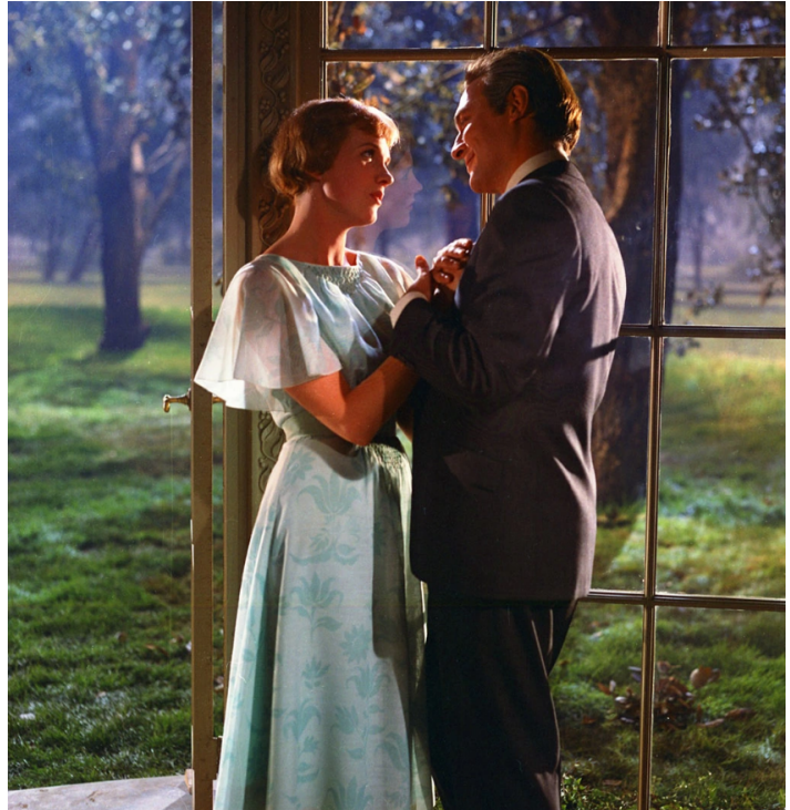
This image shows two people named Maria and Captain von Trapp (nouns)

Verbs - Express actions and states of being