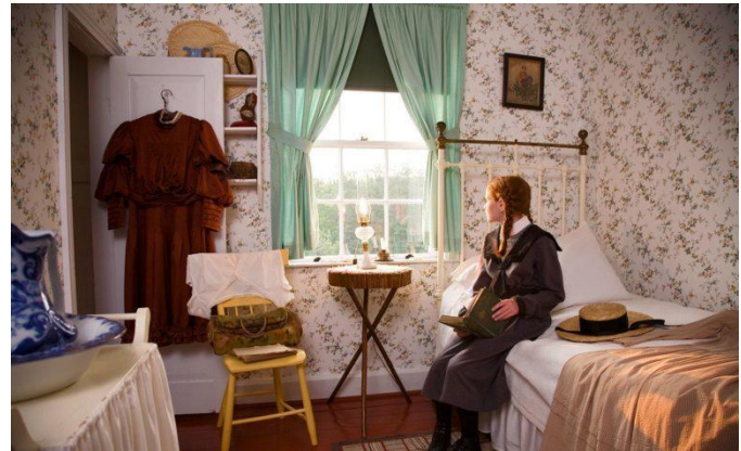
The Anne of Green Gables set by Tourism PEI

For example, in the first paragraph of Chapter IV, Montgomery describes the window in Anne's bedroom: "the window through which a flood of cheery sunshine was pouring and outside of which something white and feathery waved across glimpses of blue sky."