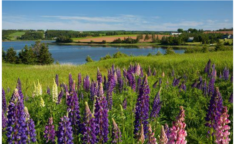
Prince Edward Island landscape

A huge cherry-tree grew outside, so close that its boughs tapped against the house, and it was so thick-set with blossoms that hardly a leaf was to be seen. On both sides of the house was a big orchard, one of apple-trees and one of cherry-trees, also showered over with blossoms; and their grass was all sprinkled with dandelions. In the garden below were lilac-trees purple with flowers, and their dizzily sweet fragrance drifted up to the window on the morning wind.