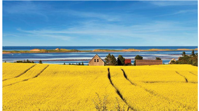
Prince Edward Island landscape

In this exercise you will find some of those descriptions in the text excerpts above. Then you will create your own descriptions using Montgomery's style.