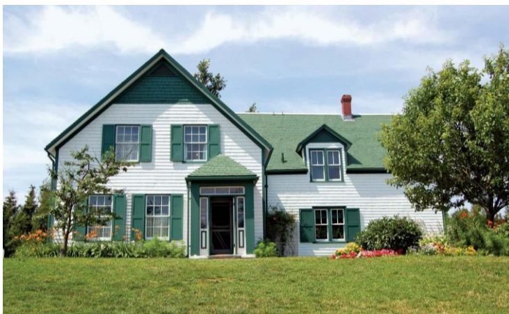
The Green Gables Farmhouse on Prince Edward Island

Anne dropped on her knees and gazed out into the June morning, her eyes glistening with delight. Oh, wasn't it beautiful? Wasn't it a lovely place? Suppose she wasn't really going to stay here! She would imagine she was. There was scope for imagination here.