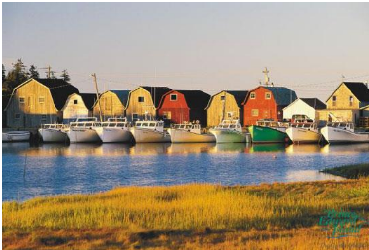
Boats in Prince Edward Island

Above the bridge the pond ran up into fringing groves of fir and maple and lay all darkly translucent in their wavering shadows. Here and there a wild plum leaned out from the bank like a white-clad girl tip-toeing to her own reflection. From the marsh at the head of the pond came the clear, mournfully-sweet chorus of the frogs.