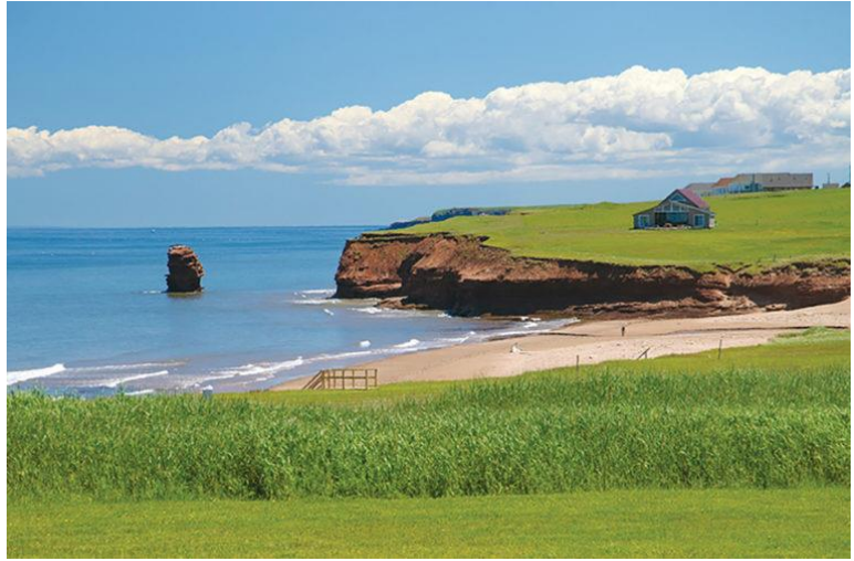
Prince Edward Island landscape

Below them was a pond, looking almost like a river so long and winding was it. A bridge spanned it midway and from there to its lower end, where an amber-hued belt of sand-hills shut it in from the dark blue gulf beyond, the water was a glory of many shifting hues—the most spiritual shadings of crocus and rose and ethereal green, with other elusive tintings for which no name has ever been found.