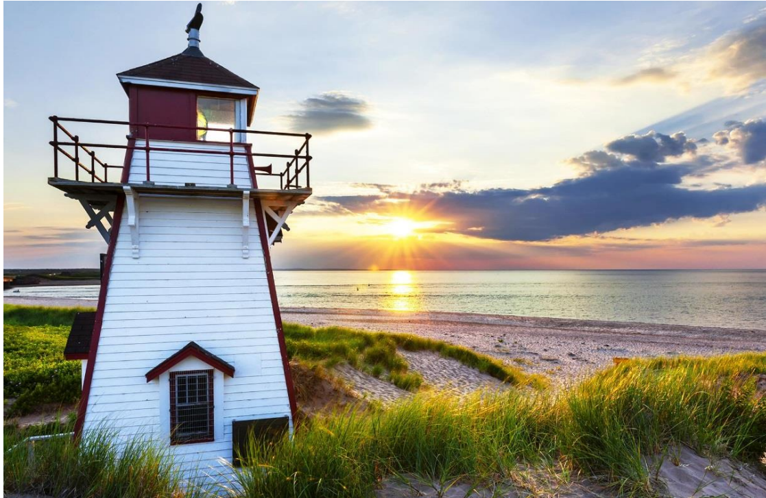
Covehead Harbour Lighthouse on Prince Edward Island

Part 2: Using what you have learned about L.M. Montgomery’s writing style, write five of your own descriptions. Get inspiration from the natural world, for example a beautiful tree in your backyard, a flower in your school garden or the soft grass at your local park.