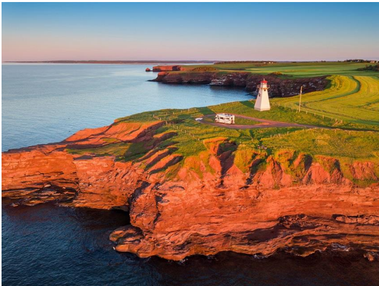
Prince Edward Island landscape

Below the garden a green field lush with clover sloped down to the hollow where the brook ran and where scores of white birches grew, upspringing airily out of an undergrowth suggestive of delightful possibilities in ferns and mosses and woodsy things generally. Beyond it was a hill, green and feathery with spruce and fir; there was a gap in it where the gray gable end of the little house she had seen from the other side of the Lake of Shining Waters was visible.