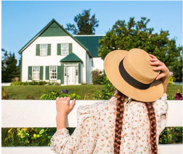
The Green Gables farmhouse on Prince Edward Island

The setting of Anne of Green Gables is based on the real-life community of Cavendish, Prince Edward Island, Canada. The book's author, L.M. Montgomery, grew up on her grandparents' farm in Cavendish during the late Victorian period. Her cousins also owned a nearby farm called Green Gables. Montgomery's writing is known for its detailed descriptions of the setting, allowing the reader to fully imagine the views, scents and textures that her characters experience.