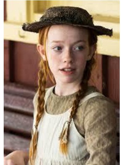
Anne from "Anne with an E" on Netflix

But it was morning and, yes, it was a cherry-tree in full bloom outside of her window. With a bound she was out of bed and across the floor. She pushed up the sash—it went up stiffly and creakily, as if it hadn't been opened for a long time, which was the case; and it stuck so tight that nothing was needed to hold it up.