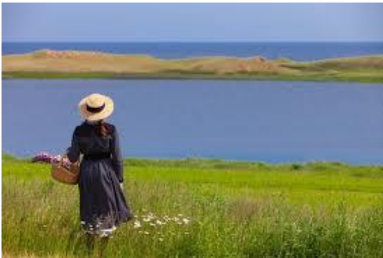
Prince Edward Island

In the story, 11-year-old Anne is left orphaned after the death of her parents. Anne is very lonely and only has her vivid imagination to keep her company.