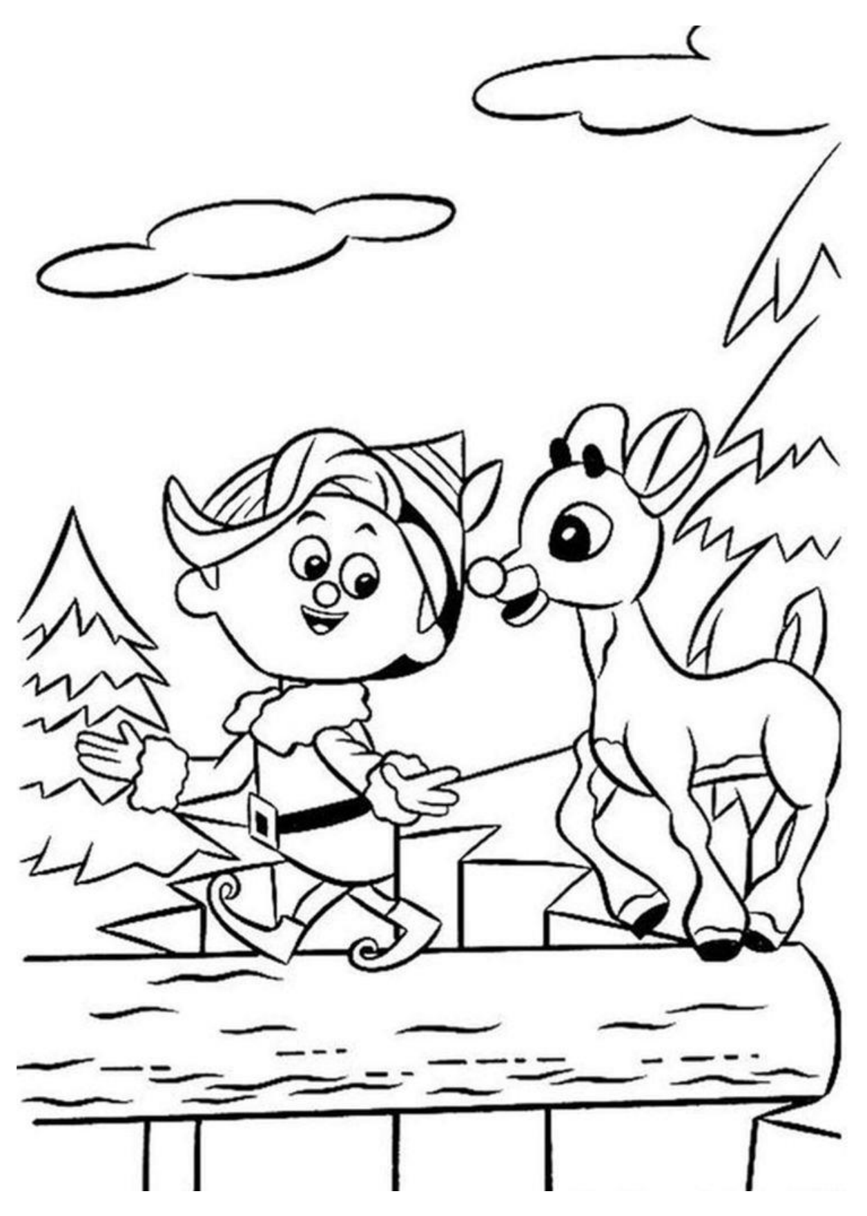
Art Activity – Color Rudolph and Hermey

NC State Standards – CCR Anchor Standards – NC.3.OA.3, NC.3.OA.7, NC.4.OA.3, RL.2.1, RL.2.3